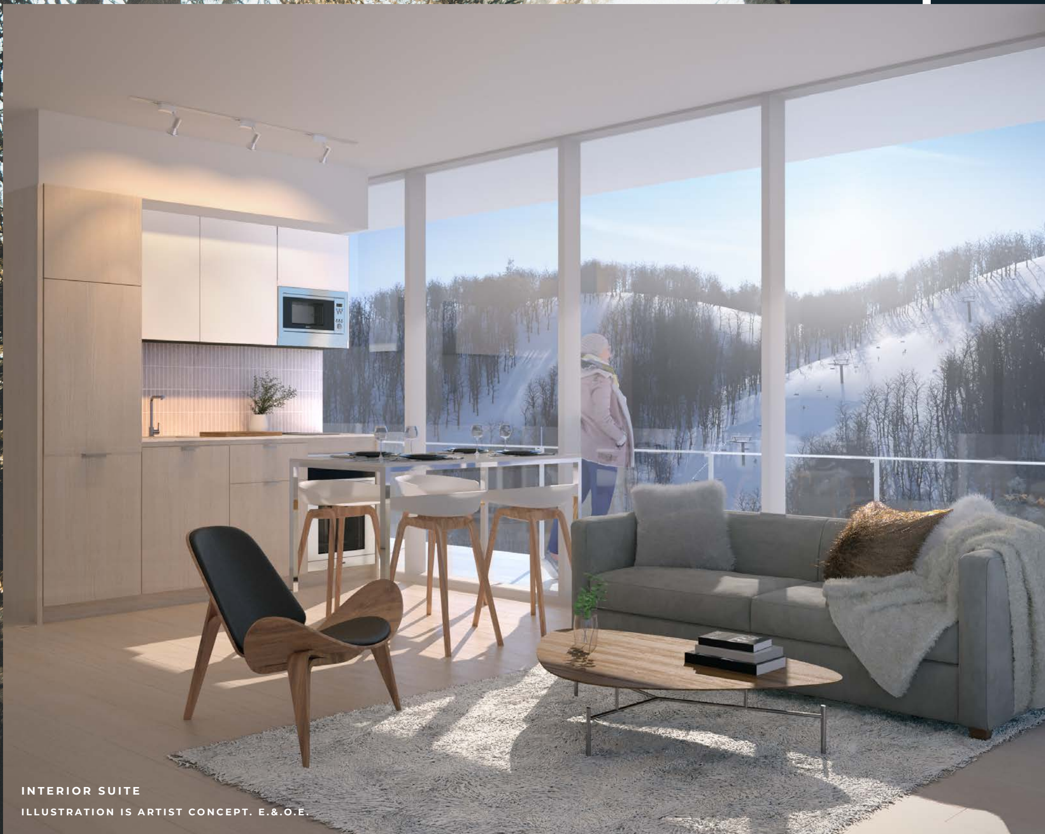
INTERIOR SUITE ILLUSTRATION IS ARTIST CONCEPT. E.&O.E.