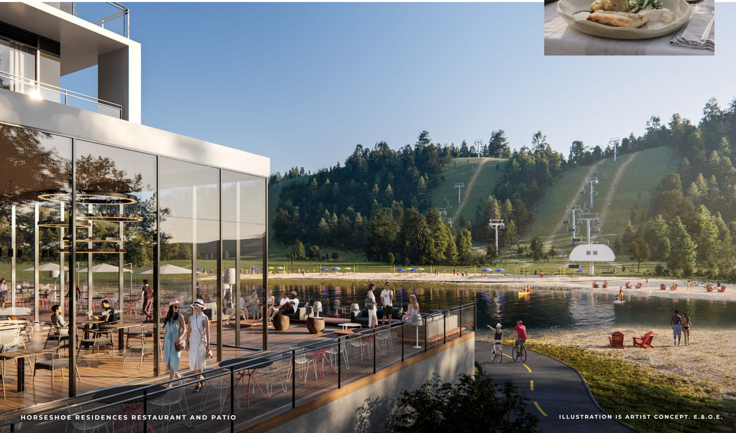
HORSESHOE RESIDENCES RESTAURANT AND PATIO