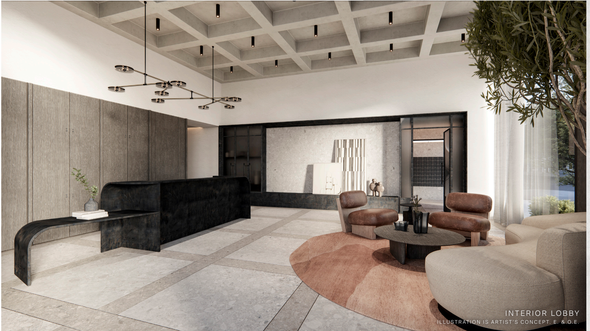
INTERIOR LOBBY ILLUSTRATION IS ARTIST'S CONCEPT. E. & O.E.