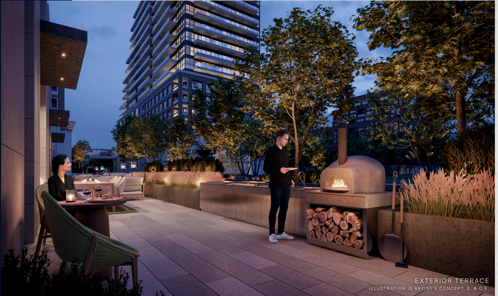
EXTERIOR TERRACE ILLUSTRATION IS ARTIST'S CONCEPT. E. & O.E.