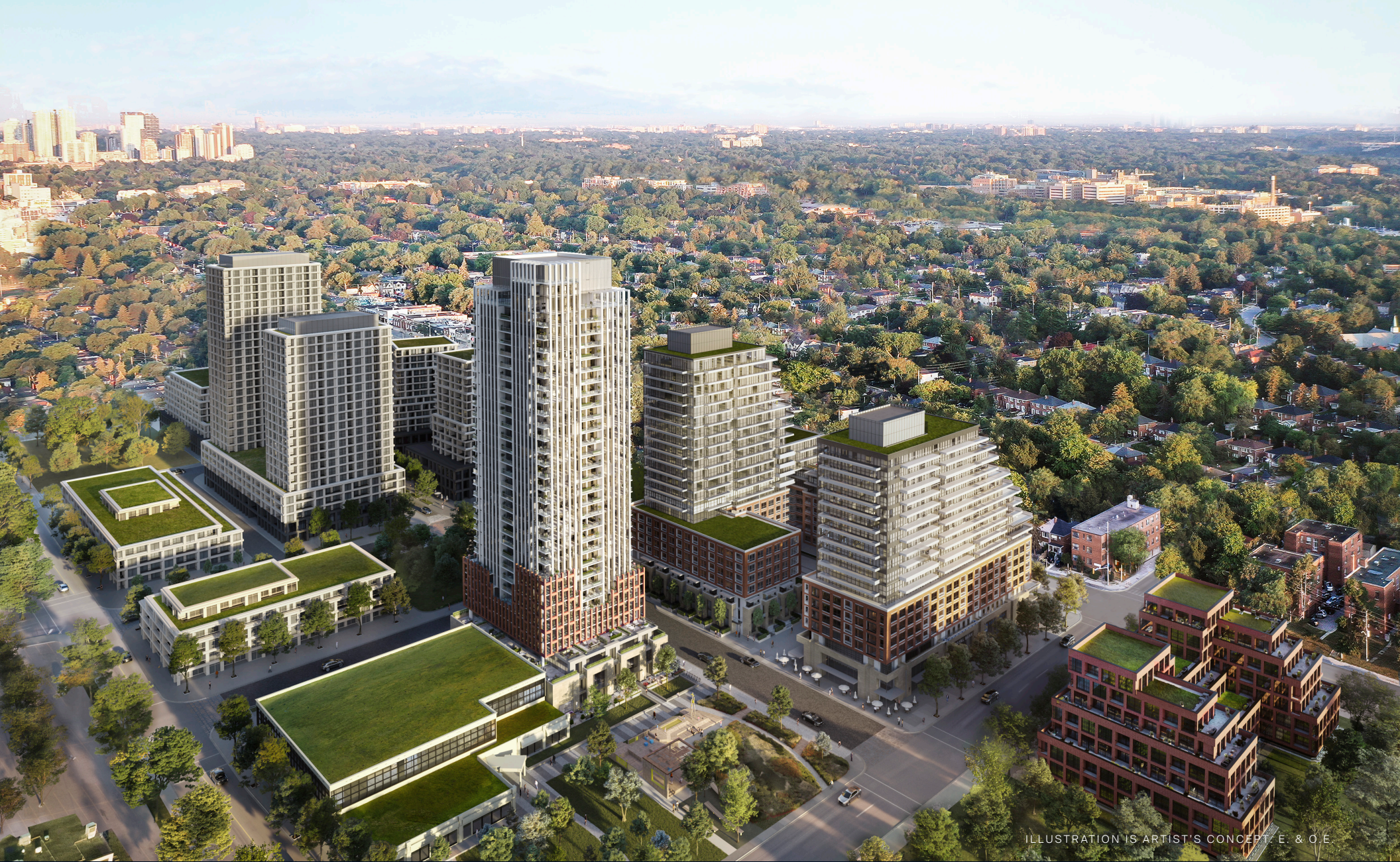
ILLUSTRATION IS ARTIST'S CONCEPT. E. & O.E.