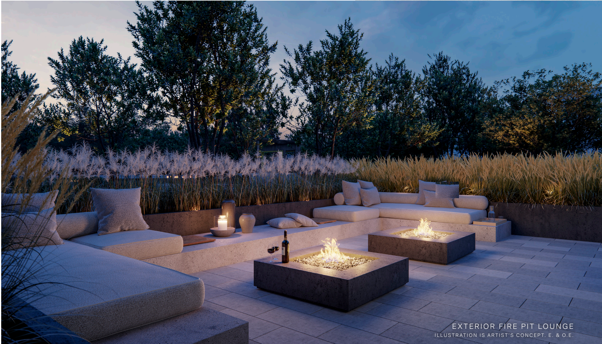
EXTERIOR FIRE PIT LOUNGE ILLUSTRATION IS ARTIST'S CONCEPT. E. & O.E.

“THE FREDERICK IS THE CROWN JEWEL OF THIS MASTER-PLANNED COMMUNITY. OVERLOOKING THE GARDEN-LIKE NEIGHBOURHOOD OF LEASIDE, IT COULDN'T BE MORE PERFECT - WHETHER IT'S THE SHOPS ON EGLINTON OR THE PEDESTRIAN MEWS, WE PAID SPECIAL ATTENTION TO CREATING A DESTINATION.”