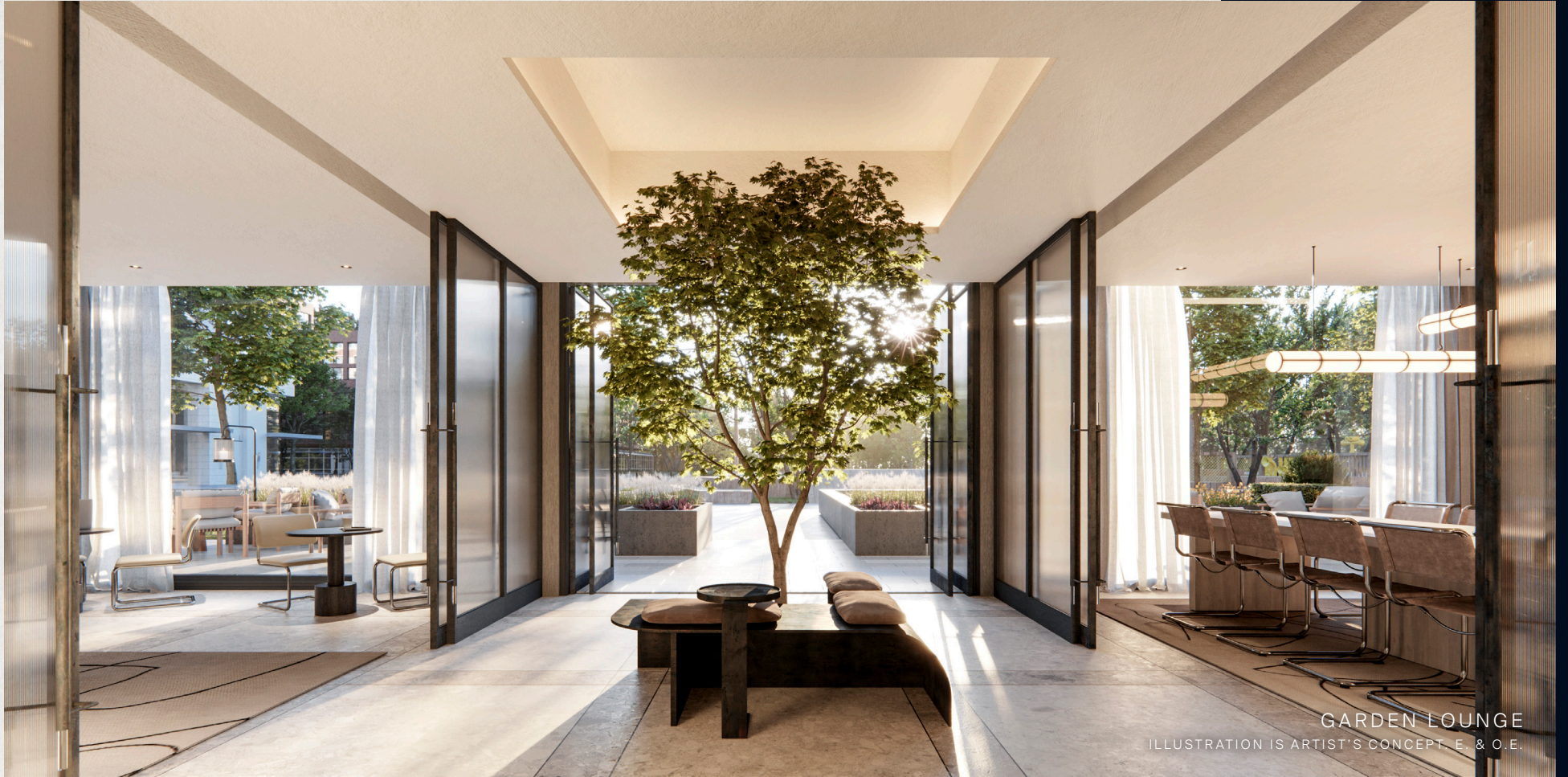
GARDEN LOUNGE ILLUSTRATION IS ARTIST'S CONCEPT. E. & O.E.