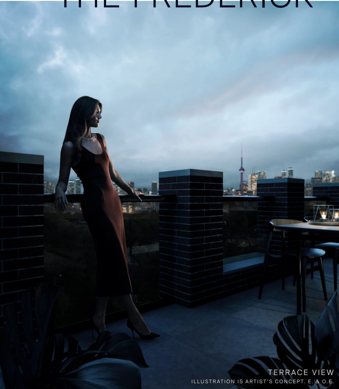
TERRACE VIEW ILLUSTRATION IS ARTIST'S CONCEPT, E. & O.E.